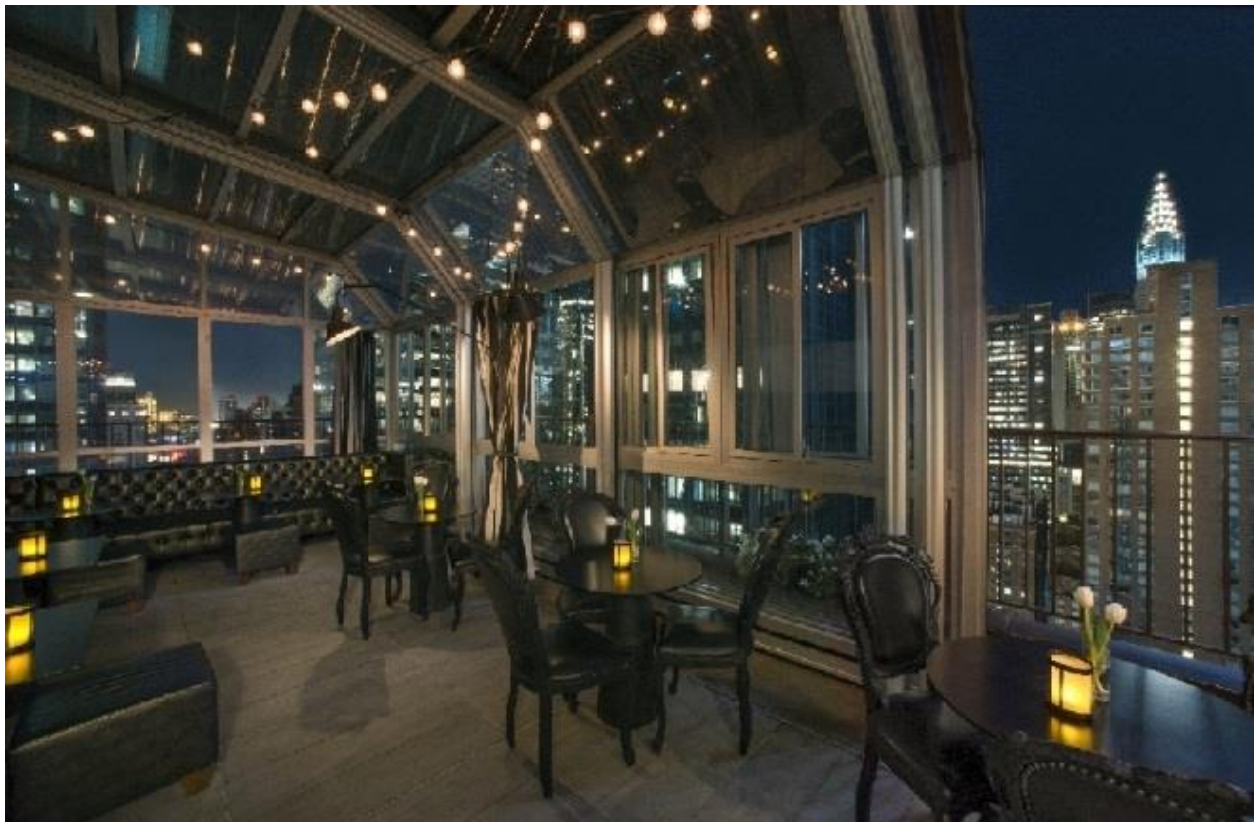
Upstairs at The Kimberly Hotel 212 702 1685 145 East 50th Street New York New York 10022