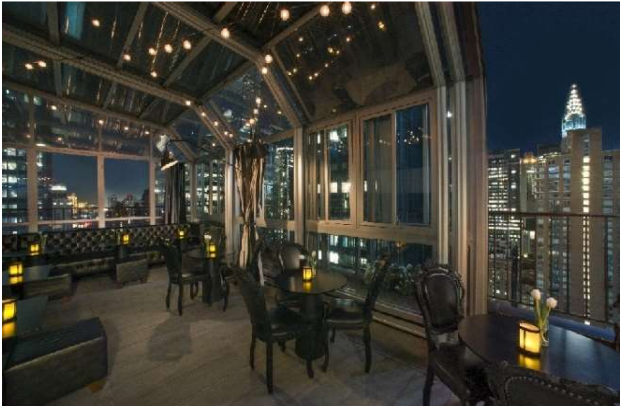
Upstairs at The Kimberly Hotel 212 702 1685 145 East 50th Street New York New York 10022